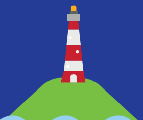
Reducing annual operating costs