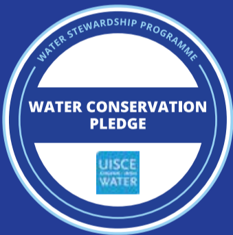
Pledge to conserve