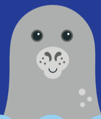
Protecting the environment