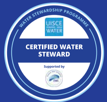
Best practice certification