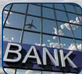
Financial & Legal Services